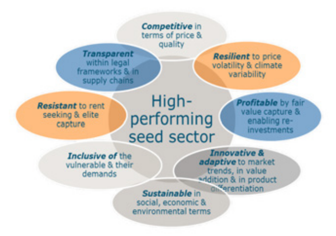
Figure 3 Seed sector vision

The vision for the seed sector in Nigeria is to become more competitive, resilient, profitable, innovative and adaptive, sustainable, inclusive, resistant and transparent. The vision is illustrated in Figure 3.