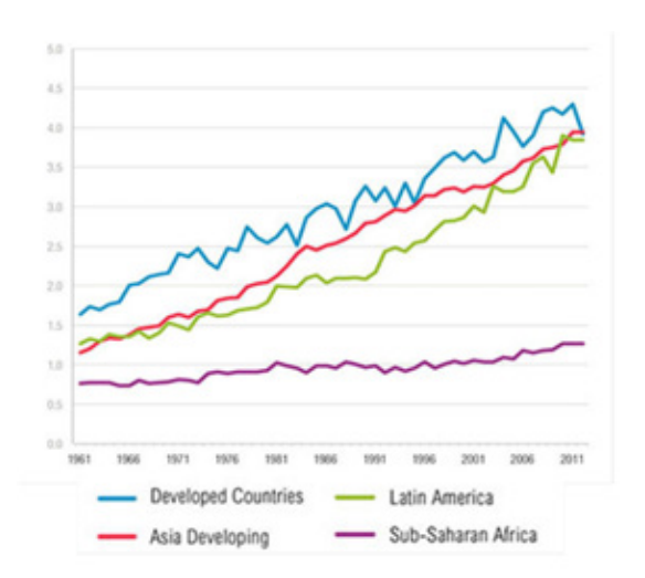
Figure 1 Cereal yields - global trends

Despite 50 years of significant investments in crop improvement and formal seed system development, more than 90% of the seed used by farmers in sub-Saharan Africa (SSA) is obtained from informal seed sources. Crop productivity in SSA is considerably lower than in other continents (see Figure 1). The Global Yield Gap Atlas (2020) illustrates the difference between potential yields and yields achieved in practice with the example of maize and rainfed rice in Nigeria, where the gap is more than 250%. It is estimated that 50% of the yield gap can be closed with the use of quality seed of improved and/or hybrid varieties; the other 50% through the application of good agronomic practices and the use of fertilizers. The percentage of Nigerian farmers using quality seed of improved varieties is below 15% (TASAI, 2019).