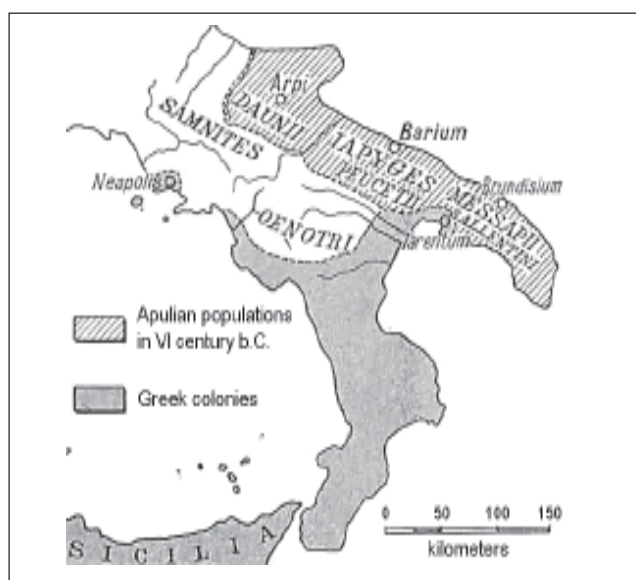
Fig. 2: Distribution of Apulian populations in the VI century B.C. (modified after Baldacci, 1962).