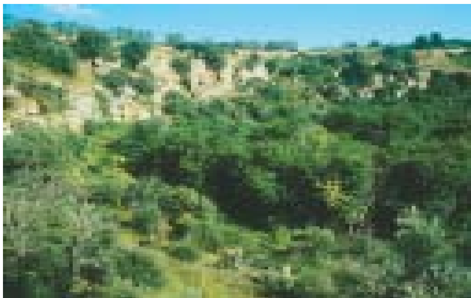
Fig. 7: The Gurgo di Andria, one of the largest collapse dolines in the Bari province.