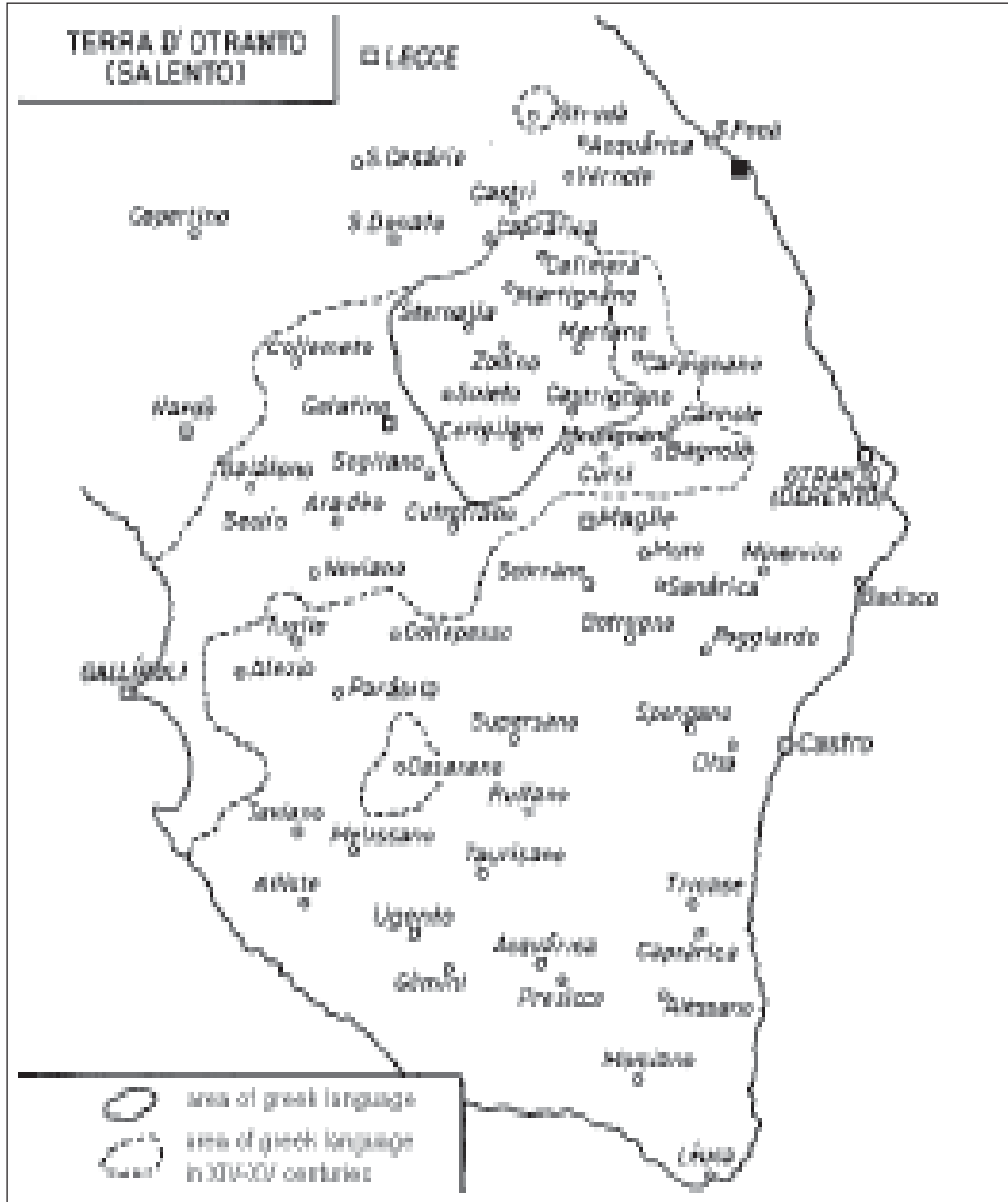
Fig. 3: Map of Grecča Salentina (modified after Rohlfs, 1974). The dark square on the Adriatic coast south of San Foca marks the location of the Grotte della Poesia karst system.

The complex historical and linguistic framework above outlined strongly controlled the evolution of local languages and dialects in Apulia. As a consequence, the terms used to describe landforms and morphological features of the apulian karst are extremely variable throughout the region.