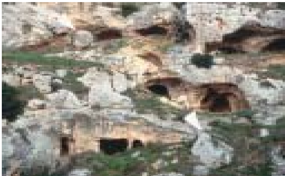
Fig. 6: Rock fall blocks (marked with white arrows) along the flank of a gravina. Note the high number of caves which were inhabited in medieval age, at the time of the so-called “rupestrian civilization”.