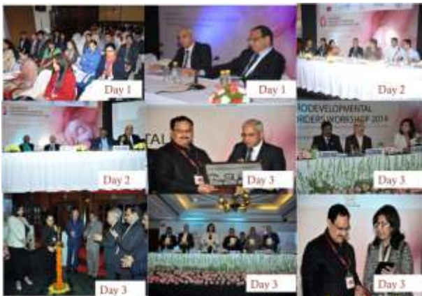
Fig. 1: Neurodevelopmental Disorders workshop was organized in December 2014. The picture shows the different events during the workshop.

Educating the parents and children and the society at large is an important aspect about management of any disease. The Child Neurology Division has played a pivotal role in educating the society about NDDs (Fig. 1),