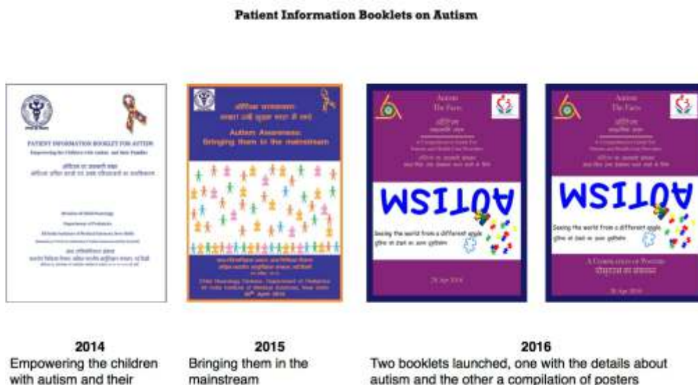
Fig. 3 : Autism-related patient information booklets launched by Child Neurology Division, Department of Pediatrics, AIIMS

autism (Fig. 2 to 4), and epilepsy by organizing regular public health lectures, television and radio shows/ interviews, newspaper interviews and information materials. In addition, the division has published patient educational booklets on all the common pediatric neurological disorders. These are freely downloadable from http://www.aiims.edu/en/2014-12-24-07-16-28/neurology_educatio.html (Fig. 3) (13). Also the division has launched a helpline (with mobile number 9868399037 and email: autismhelp.pedsaiims@gmail.com , pedneuroaiims@yahoo.com ) to facilitate help to parents of sick children.