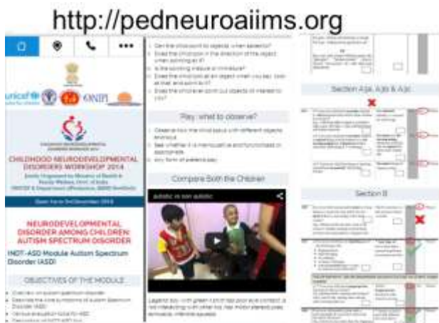
Fig. 5 : Snapshot of microsite, with autism related information, launched by Child Neurology Division, Department of Pediatrics, AIIMS

were later updated as per the latest guidelines. These AIIMS modified INDT tools for diagnosis of epilepsy, neuromuscular impairment, ADHD, and autism have been validated in institutional research. The tools for Autism Spectrum Disorder ( https://play.google.com/store/apps/details?id=app.autism.sanyakhurana.diagnostictoolforautismspectrumdisorder and https://itunes.apple.com/us/app/autism-spectrum-disorder-diagnostic/id1151524697?mt=8 ) and epilepsy ( https://play.google.com/store/apps/details?id=com.weboutsourcing.childhoodepilepsy.childhoodepilepsydiagnostictool&hl=en and https://itunes.apple.com/in/app/childhood-epilepsy-diagnostic/id1078173463?mt=8 ) have been converted into a mobile application (Fig. 4) which is downloadable free of cost, while applications for other tools are under development.