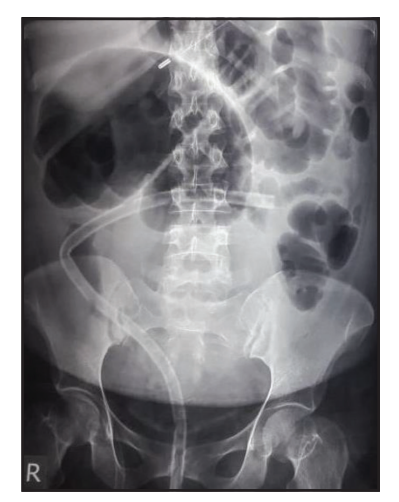
Figure 1: Abdominal plain radiograph revealed significant dilatation of the caecum and ascending colon (case 1).

Initially, the patient managed conservatively with Ryle's tube which revealed bilious output and flatus tube through which feculent material was coming. The patient was temporarily relieved of symptoms and pain increased again after 1 day. So, the patient was referred to the emergency department of DMC & H Ludhiana on postoperative day 2.