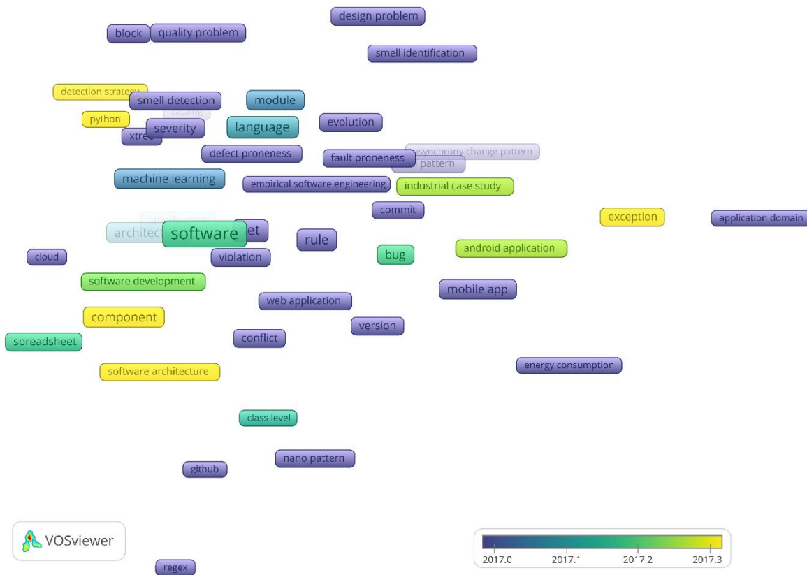
Fig. 4. The term “timeline landscape” for the period 2017-2018