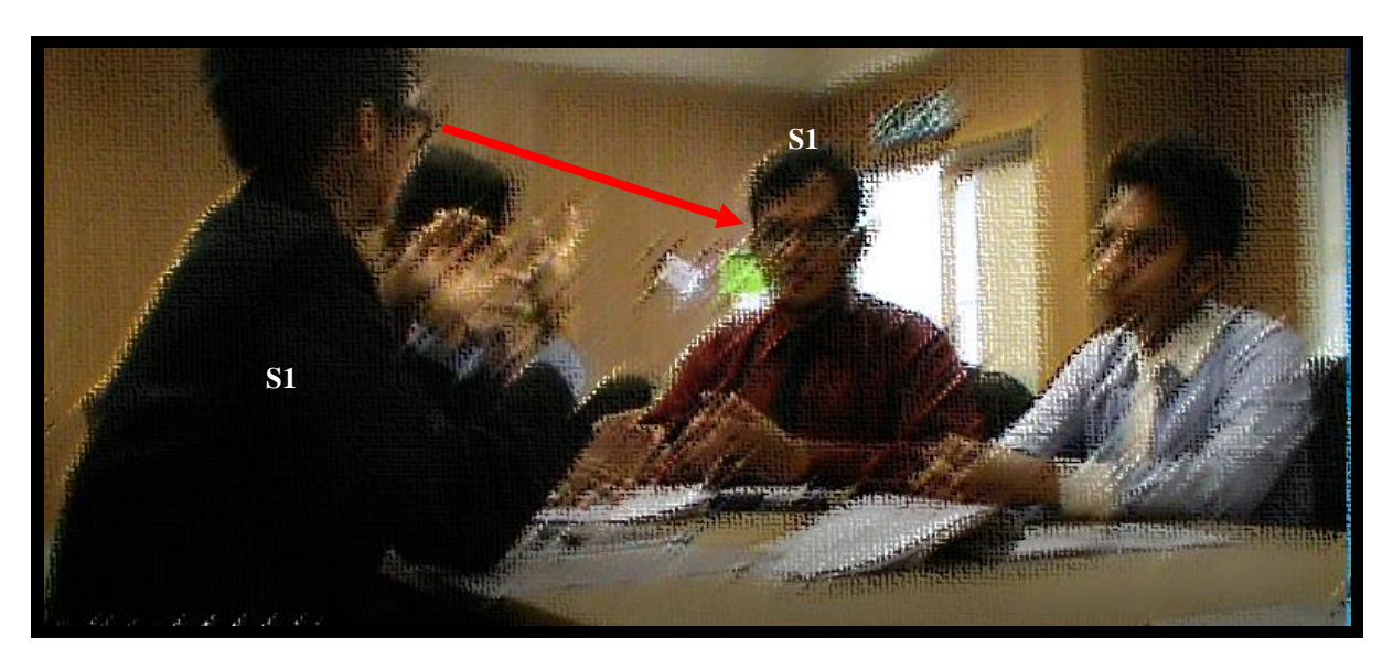
Figure 1. The Current Speaker Gaze-selected the Next Speaker.

the discussion continues. The image of gaze-selection between S1 and S2 is illustrated by the arrow in Figure 1.