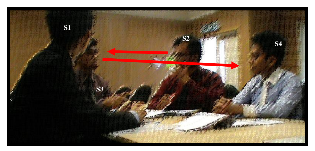
Figure 2. S2 Passed His Turn to S3; then S3 Gaze-selected S4.

In Excerpt 3, upon receiving the turn from S3, who was not ready to continue the discussion, S4, nodded (indicating agreement to accept the turn) and continued the topic of discussion by relating to two previous speakers' (S1 and S2) ideas.