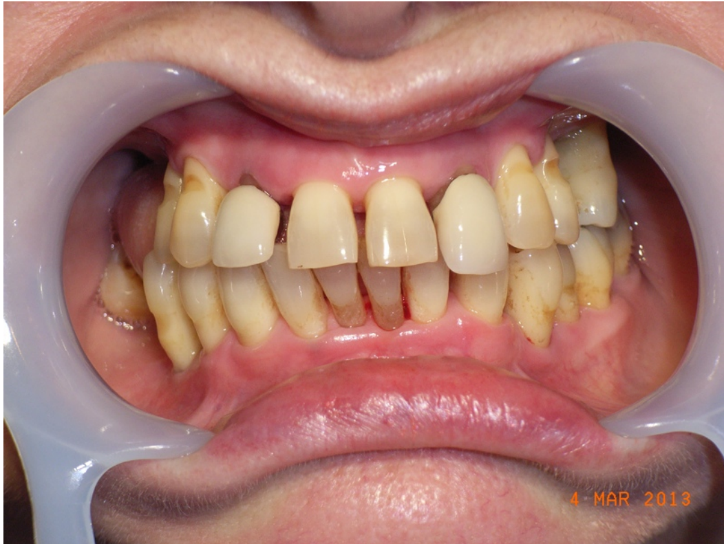
Figure 4. Patient from Figure 1 immediately following non-surgical initial therapy.