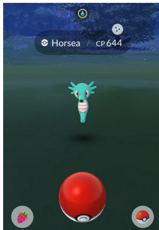
Figure 1. A screenshot from the main Pokémon capture minigame of Pokémon GO

GO are not confined within the game, but influence reality as the game is played in the real world [3]. The novelty and popularity of the game has also sparked the interest of academia, with, for example, Scopus currently as of 22th of August having indexed 300 scientific publications where the term “Pokémon GO” appears in the title or the abstract. Pokémon GO has been studied by multiple disciplines such as psychology [4], system sciences [5], law [6], business [7] digital media [8], health [9, 10], geography [11], education [12, 2] and computer science [13, 14] among others.