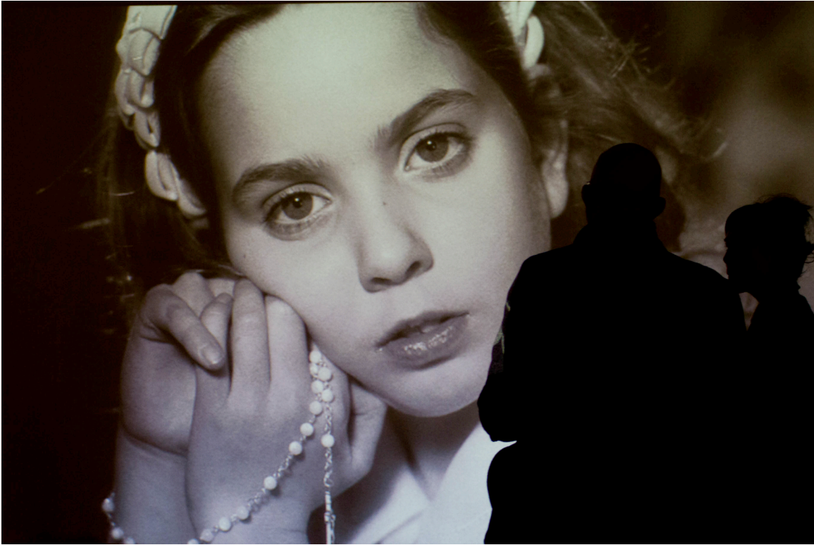
Ambika P3