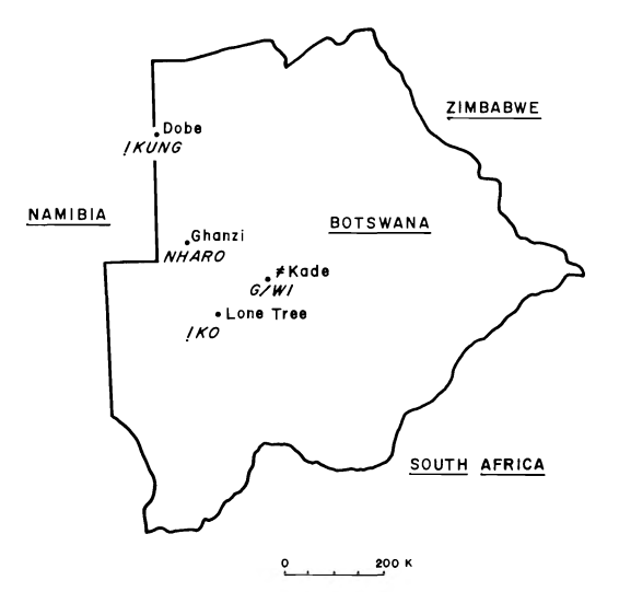
Fig. 2. Approximate locations and study sites for four Bushman groups.

residual variance of actual values about predicted values. If there is no temporal autocorrelation in a resource (i.e., if it is completely unpredictable according to Roughgarden's definition), then the best estimate of the amount of the resource at some point in the future would be the long-term mean. In this limiting case, the measure of predictability suggested here would be equivalent to the inverse of the total variance.