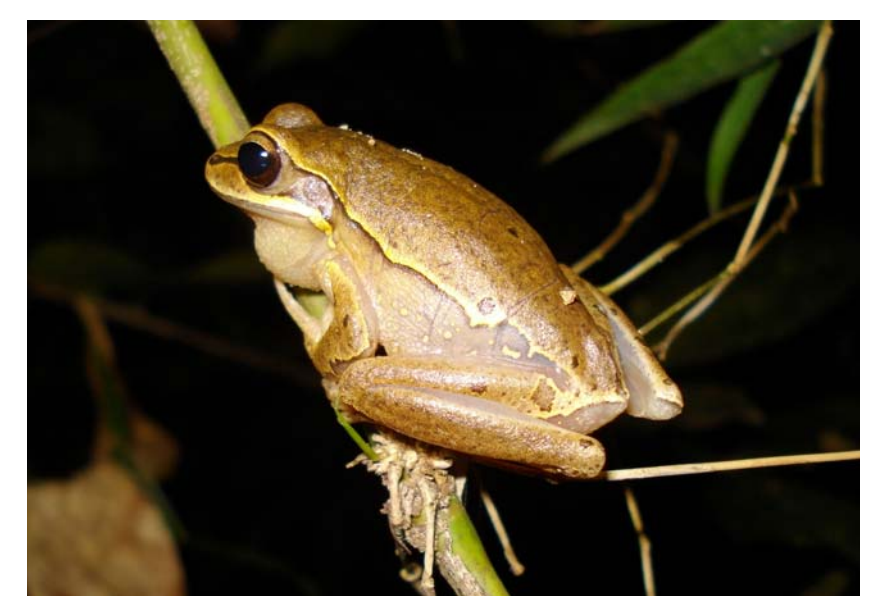
Figure 1. Adult male of Hypsiboas curupi collected in Parque Estadual do Turvo , state of Rio Grande do Sul, Brazil.

Based on specimens of the H. semiguttatus complex, Garcia et al. (2007) described a new species: Hypsiboas curupi (Figure 1), using specimens from Misiones, Argentina. In the same study, the authors pointed out the potential occurrence of the species in the Brazilian state of Paraná. Four occurrences were cited for Paraná, of specimens apparently belonging to H. curupi , but vocalizations and tadpole data that could corroborate this identification were missing at that time (Garcia et al. 2007). Subsequently, Brusquetti and Lavilla (2008) broadened the distribution of H. curupi to three localities in Paraguay.