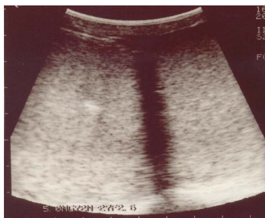
Fig. 2: Transverse ultrasonograph of paired testes showing homogeneously hypoechoic structure, with a hyperechoic circular area in the middle representing mediastinum testis