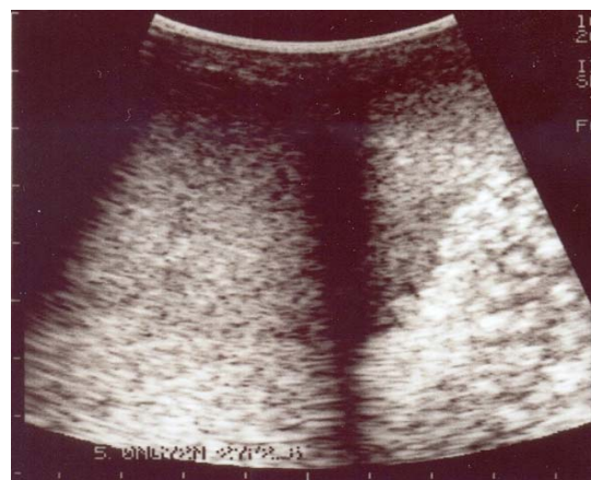
Fig. 8: Ultrasonograph of paired testes of infertile bull No. 3. About three-fourth of the right testis shows hyperechoic areas, while remaining of the right testis and whole of the left testis are normal.

The sixth bull did not give any ejaculate, although it was physically healthy. On ultrasound examination, the