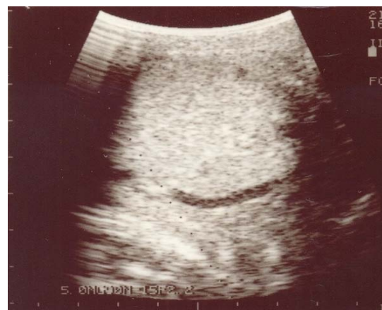
Fig. 9: Ultrasonograph of testis of infertile bull No. 4, showing a curvilinear anechoic area in the lower part.

scrotal contents appeared normal except for an anechoic area with distinct hyperechogenic margin below the testicular tunics. Whether this was dilated blood vessel or accumulation of fluid is not clear.