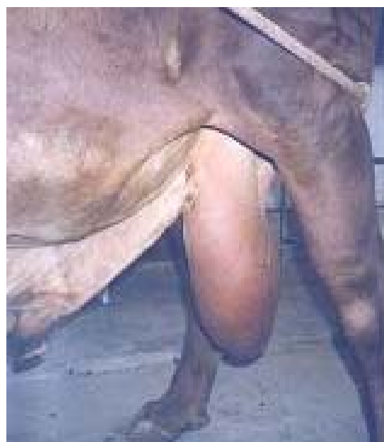
Fig. 6: Photograph of an infertile bull No. 2 showing enlarged scrotum

tissue by well defined hyperechoic margins (Fig. 7). On ultrasonographic measurement, one lesion in the testis was as large as 3.5 cm in diameter. These lesions were assumed to represent cysts (spermatocoele), as has been reported in dogs (England, 1991). Hyperechogenic mass, along with anechoic areas, was also seen below the scrotal skin. Whether this hyperechoic mass represented the fibrin within the fluid is not clear. Ahmad et al. (1999) described a case of hydrocoele in a male goat following ligation of testicular artery. The affected testis was encircled by anechoic fluid with hyperechoic fibrin strands within the fluid. In other studies (Ahmad and Noakes, 1995b; Ahmad et al. , 2000), anechoic areas, representing sperm granulomata, were seen within the epididymal head and the tail of infertile rams. Thus, the bull under study appears to have hydrocoele and spermatocoele with sperm granulomata of the epididymal head.