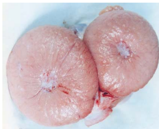
Fig. 1: Cross section of a normal bull testis showing mediastinum testis in the middle.

In fertile buffalo and cattle bulls, the tail of the epididymis was a more heterogeneous structure than the testis. As a whole, its structure was hypoechoic relative to that of the testis (Fig. 4). These findings are comparable to those of Cartee et al. (1986) and Pugh et al. (1990) for the boar and dog, respectively. Similar observations have been recorded for bulls (Cartee et al. , 1989), male goats and rams (Ahmad et al. , 1991). It seems that the testis is relatively more homogenous, whereas the tubules in the epididymis are larger and thus generate more specular echoes (Leung et al. , 1984), which might have been responsible for its heterogeneous appearance. The head of the epididymis was less echogenic than the testicular parenchyma and homogeneous in echotexture. Numerous hypoechoic tubular structures represented pampiniform plexus. The epididymal body appeared as hypoechoic structure with echogenic margin.