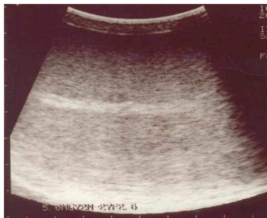
Fig. 3: Longitudinal ultrasonograph of normal testis showing a hyperchoic line in the middle representing mediastinum testis