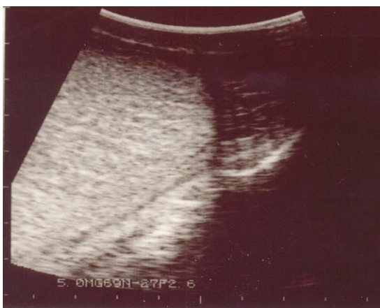
Fig. 4: Longitudinal ultrasonograph showing normal testis (on the left) and epididymal tail (top right)

dead and abnormal spermatozoa in its semen (Table 2). The testes were hard in consistency. Ultrasonography revealed an abundance of hyperechoic areas with acoustic shadowing scattered in the parenchyma of both testes (Fig. 5). These hyperechoic areas were assumed to represent mineralization in the testes. Ahmad et al. (1993a) and Ahmad and Noakes (1995a) observed similar hyperechoic areas in the testicular parenchyma of infertile goats. On histopathological examination, these areas were found to represent testicular degeneration with mineralization of seminiferous tubules. According to Lenz and Giwerzman (2008), such bright echogenic spots were representing microlithiasis or microcalcifications. It appears that in this bull, poor semen quality was due to bilateral testicular degeneration with mineralization of seminiferous tubules.