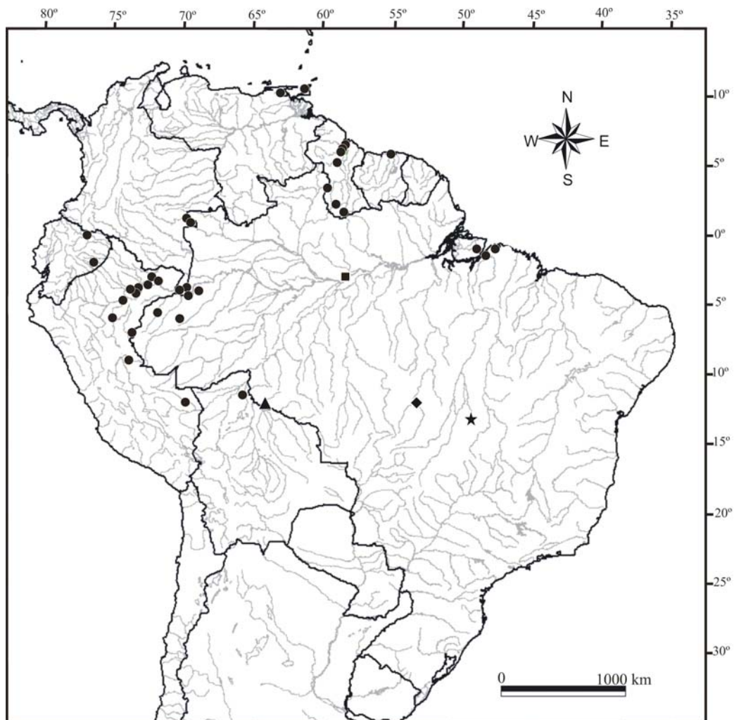
Figure 2. Geographic distribution of Pipa pipa (Linnaeus, 1758) based in literature data [◆ = Bokermann (1962); • = Trueb and Canatella (1986); ▲ = Brandão (2002); ■ = Lima et al. (2005)] and our record (★).

Species that typically occurs in Amazonia, Pantanal, Chaco, Caatinga and Atlantic Forest can occasionally be found in transition zones with Cerrado (W. Vaz-Silva, pers. obs.). Our record in a Cerrado gallery forest reinforces the importance of preserving riparian environments for biodiversity conservation.