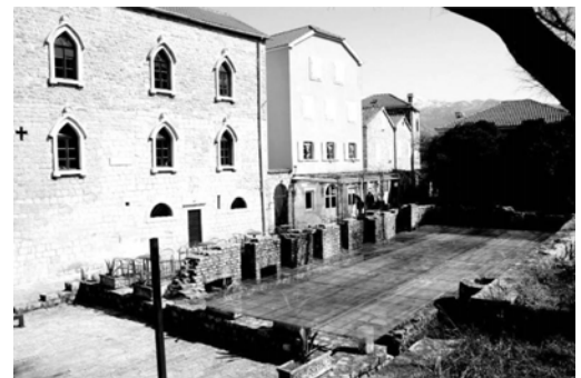
Fig. 2 Area around the Early Christian basilica according to the renewal project

Despite the fact that only the foundations and the parapet level of the walls have been preserved, the early Christian basilica is one of the most valuable monuments in the Budva Old Town. It does not only represent an exquisite and authentic architectural and cultural heritage, but a unique place of powerful spiritual and symbolic energy, as well. It was built in the late 5 th and early 6 th century, before the Christian church Great Schism in 1054, and is a rare building of old Christian architecture and a sacred place which even today radiates with a unique ecumenical Christian spirit.