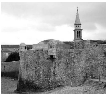
Fig. 6 Position of the telescope at Repeno Tower

It was obvious that apart from the presented projects many more could have been created. The view of the author of this paper is that it would necessary to go through with the projects that could be effected and whose realisation could already be evaluated and