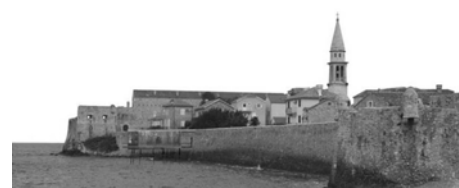
Fig. 5 External addition to the Gate of Murava

The Murava gates are an exquisite and exclusive point at the ramparts, being utilised in various ways throughout the history of Budva – one of the four oldest town gates. There is a great view on the gates from the sea. However, they are not accessible from the ramparts, but are from the Old Town, along a street. The area is good for placing a wide slab – a pier above the sea, which can be covered. During the summer season, when the weather is favourable, the place is suitable for chamber concerts, small performances, monodramas, debates, etc. Alternatively, this pier can be completely closed in glass, shaped as a transparent structure of a cubic form (area of about 40 m 2 ), overhanging the sea, well lit from the inside, so that by night it could be seen as a special attraction both from the sea and the ramparts. In this way, a special area is made, with extraordinary ambience surrounding, suitable for utilisation all year round, for concerts, performances, lectures, or exclusive diplomatic, business or scientific gatherings.