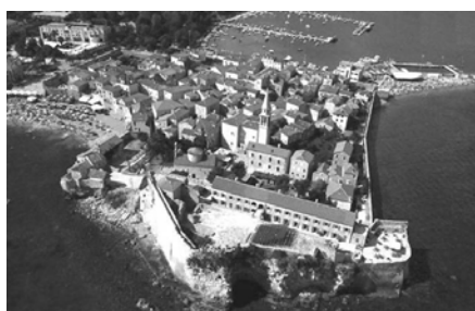
Fig. 1 Panoramic view of Old Town of Budva

Among the Montenegrin coastal town, Budva stands out not only for its historic and cultural significance, as one of the oldest settlements in the region, but also for its significant architectural and urban values. It has clearly defined and well preserved spatial characteristics related to its origins in the Illyrian – Hellenistic period and later on development in the Roman and Byzantine period. It is a typical well fortified mediaeval coastal town with a military fortification - a citadel, a civilian settlement and a harbour.