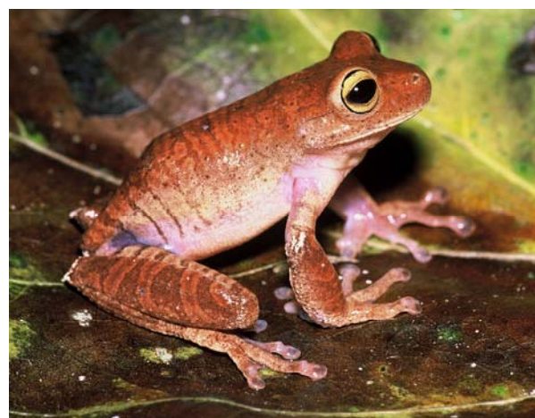
Figure 1. Adult live male of Bokermannohyla ibitipoca from Pedra Azul, municipality of Domingos Martins, state of Espírito Santo, Brazil.

Recently, the hylid frog Dendropsophus ruschii was rediscovered from Pedra Azul (Peloso and Gasparini 2006), in the same place where we observed B. ibitipoca . This mountainous region is located in the Atlantic Rainforest domain, characterized by high levels of endemism, including at least 14 endemic species of frogs (Pombal Jr. et al. 2003; Cruz and Feio 2007).