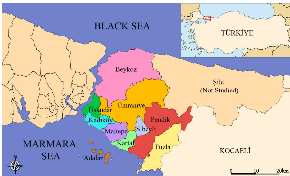
Figure 1. Districts studied in Istanbul during 2005-2007 (Beykoz, Üsküdar, Kadıköy, Kartal, Ümraniye, Maltepe, Tuzla, Pendik, Adalar and Sultanbeyli)

NW part of Turkey ( 41^{\circ} 01.2' N , 28^{\circ} 58.2' E ) and it extends both on European (Thrace) and Asian (Anatolia) sides of the Bosphorus. It is the only metropolis in the world which is situated on two continents [1-5]. Its neighbours are the Black Sea in the north, Marmara Sea in the south, Kocaeli City in the east, and Tekirdağ City in the west (Figure 1). Istanbul has approximately 5100 \text{ km}^2 of land area and 12,573,836 population. In its long history, Istanbul served as a capital city of the Roman Empire (AD 330-395), Byzantine Empire (AD 395-1204 and AD1261-1453), Latin Empire (AD 1204-1261), and Ottoman Empire (AD 1453-1922) [3, 6]. In addition to its rich history, high population and productive economy, Istanbul also has a wide variety of ecological features [3].