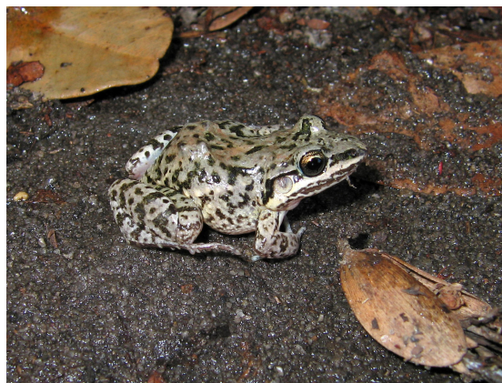
Figure 1. Leptodactylus caatingae , MNRJ40825, at municipality of São João do Cariri, state of Paraíba, Brazil.

Brazil. Individuals of L. caatingae (Figure 1) were found in these temporary ponds and identified based on the original description. The specimens were deposited in the Museu Nacional do Rio de Janeiro (MNRJ40825, MNRJ40826, MNRJ40827) and in the Coleção Herpetológica do Departamento de Sistemática e Ecologia da Universidade Federal da Paraíba (UFPB 4310 - 4314), Brazil.