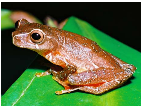
Figure 1. Adult specimen of Dendropsophus ruschii from Pedra Azul, Domingos Martins, Espírito Santo state, Brazil. CFBH 10584.

Ruschi's treefrog, Dendropsophus ruschii (Figure 1), is a species endemic to the Atlantic Rainforest in the Espírito Santo state, southeastern Brazil. All known specimens were collected in this forest formation, at elevations around 800 m (Weygoldt and Peixoto 1987; Frost 2004).