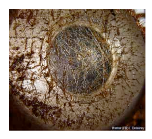
Fig. 2. Transmissometer after 40 days in Trondheim harbour (Norway) during summer.

An increase of the sensor response due to biofouling is quite particular to fluorescence sensors, usually the drift observed due to biofouling is a decrease in the response. This can be observed with conductivity sensors (electrode based cells), transmissometers, pH sensors and oxygen sensors (Clark electrodes and Optodes) (Delauney and Lepage, 2002).