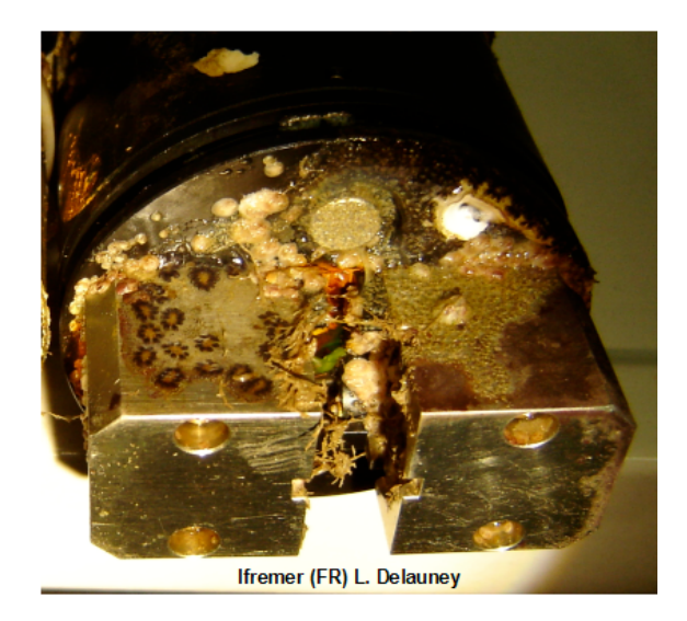
Fig. 1. Fluorometer after 30 days in Helgoland (Germany) during summer.

As shown in Fig. 3, after 7 days, due to biofouling settled on the sensitive part of the sensor, a drift can be observed on measurements produced by a fluorescence sensor (Delauney and Cowie, 2002). This type of optical sensor is very sensitive to biofouling since even a very thin biofilm on the optics can interfere with the measurement process and give rise to incorrect measurements.