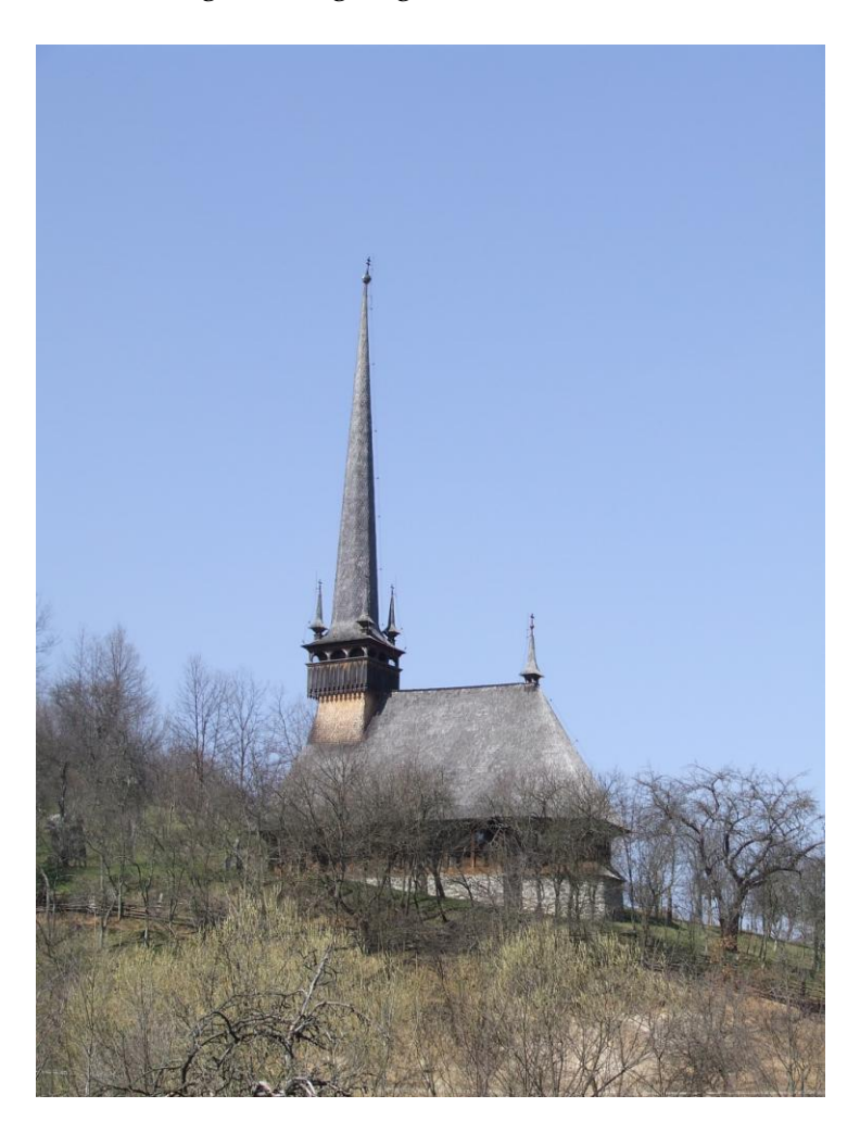
Figure 1 Freont Nicoara - The wooden pentecost church of Fildu de Sus, Sălaj County (1727).

Petranu was particularly concerned with the wooden ecclesiastical architecture of north-western Transylvania, which were now border territories with the newly diminished Hungarian state. He argued forcefully that the churches he studied represented a vigorous tradition that had borrowed architectural traditions and transformed them into distinctive local forms, making use of the specific properties of the material available to produce an authentic 'style' that he read as the sign of a Romanian national spirit (Figure 1). Petranu placed particular emphasis on the ground plans of the buildings as an indication of their national affinity – a characteristic approach he had inherited from Strzygowski – but he also attended to the paintings within the churches, in order to establish the basic characteristic of Romanian vernacular image making (Figure 2).