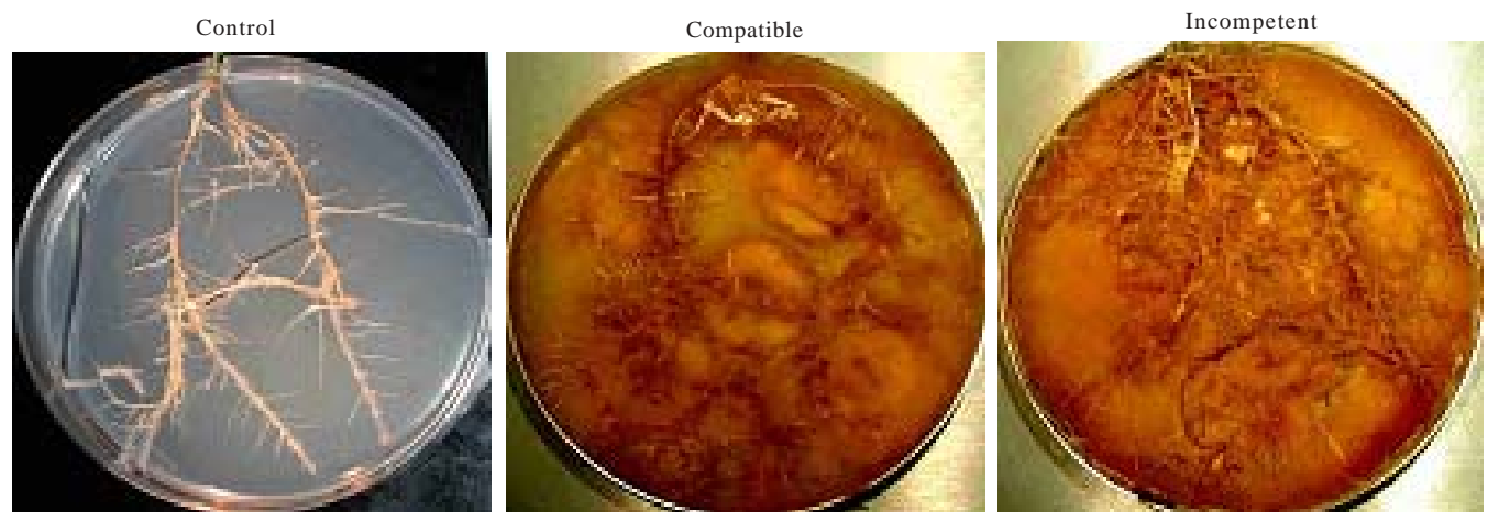
Figure 1. Root systems of poplar in control plant (left) and plants inoculated with compatible MAJ (middle) and incompetent NAU (right) P. involutus isolates.

Morphological and Anatomical Characteristics. Root tips morphological changes of compatible association characteristics of mycorrhizal formation were visible one week after inoculation. The mycorrhiza continued to develop and they were mature by five to seven weeks. Development of poplar both grown in the absence and presence of P. involutus under currently described Petri dish system occurred normally.