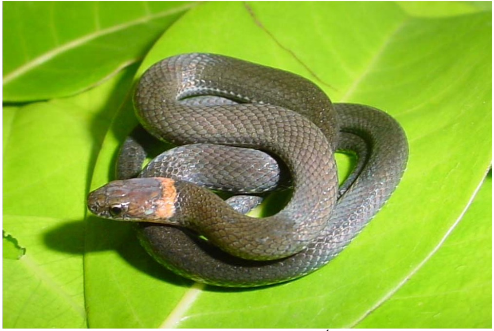
Figure 2 . Juvenile of Urotheca fulviceps (MHNLS 18539) from Los Ángeles del Tokuko village, in the western slope of Sierra de Perijá, Venezuela.