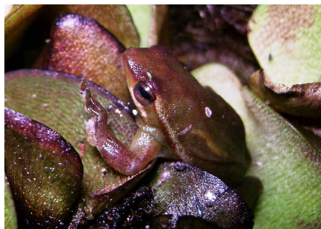
FIGURE 2. Adult male Sphaenorhynchus botocudo (MZUFV 9824 – SVL 28.6 mm) with emphasis on the presence of the distinctive longitudinal white spot under the eye, a putative autapomorphy of the species.

preservative (Figure 3), which separates S. botocudo from all other congeners, consisting in a putative autapomorphy of the species (Caramaschi et al. 2009).