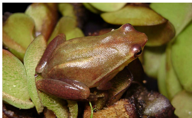
FIGURE 1. Adult male Sphaenorhynchus botocudo from Fazenda Santa Clara, municipality of Mucuri, state of Bahia, Brazil (MZUFV 9824 – SVL 28.6 mm).