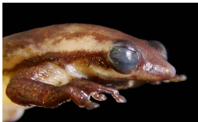
FIGURE 3. Adult male Sphaenorhynchus botocudo in preservative with emphasis on the presence of the distinctive longitudinal white spot under the eye, a putative autapomorphy of the species.