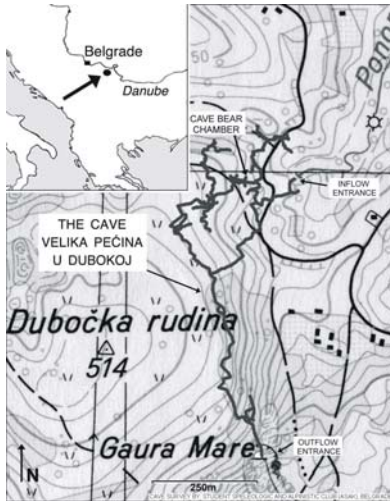
Fig. 1. Geographical position and position of passages of Velika pećina in Duboka in relation to topographic surface.

Rudina, in the region named Krš. Out of the cave, below the noticeable slope of several tens of meters in height, a short current rising and flowing into the rivulet Valja Mare. The total length of the cave is 2734 m.