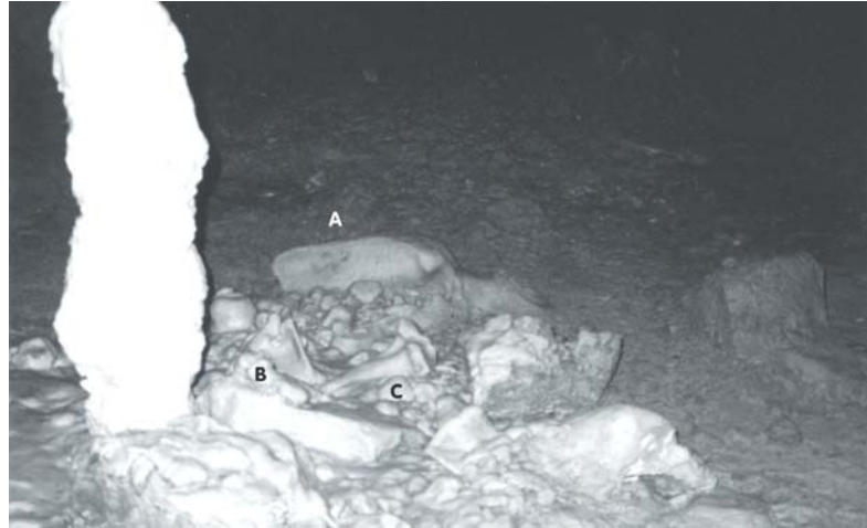
Fig. 5. Cave bear skull (A), epistropheus (B) and tibia (C) on the cave floor in situ . Сл. 5. Лобања (А), епистрофеус (В) и тибија (С) пећинског медведа in situ .