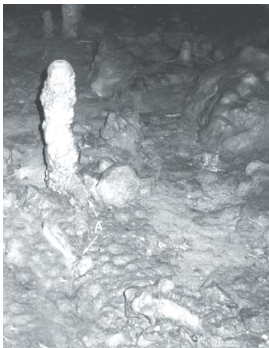
Fig. 7. Cave bear lower jaw (A) with a stalagmite 23 cm high grown up above its incisive part. Сл. 7. Доња вилица пећинског медведа (А) са сталагмитом висине 23 cm излученом на њеном предњем крају.

maxillae, their wear stage is similar, and it may be possible that they belonged to the same animal. It has only canine and fourth premolar in alveoli. Canine size indicates a male. Another mandible (DUB 01/7) has canine and three molars in alveoli. Molar crowns show advanced stage of wear, indicating mature bear. Mandible with stalagmite has complete premolar–molar row. Teeth crowns worn to dentine indicate mature animal and similar wear stage as in the skull DUB 01/1. These mandible and skull are found close to each other, they are of corresponding size and wear pattern, so presumably they belonged to a single animal.