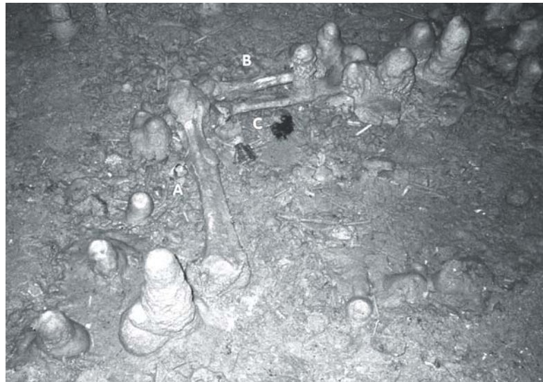
Fig. 6. Cave bear bones of a forearm in articulation: A– humerus, B– ulna, C– radius. Сл. 6. Кости предњег екстремитета пећинског медведа у артикулацији: А – хумерус, В – улна, С– радијус.