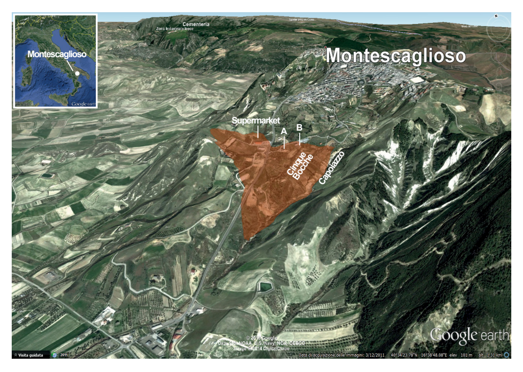
Figure 1. Montescaglioso, southern Italy. The red area shows the area affected by the 3 December 2013 Montescaglioso landslide. Locations of a supermarket ( A ) and of most damaged buildings ( B and C ) are shown. ( D ) and ( E ) show locations of the Cinque Bocche and Capoiazzo channels. Source of terrain map: Google Earth ^{TM} .