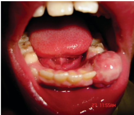
Fig. 3: Pyogenic Granuloma of Gingiva

On intraoral examination, the mucosa covering the oral cavity was reddish in color with no evidence of any hypertrophy, except for a solitary, sessile, well defined swelling in the gingiva of 33, 34, & 75 covering the crowns of 33 & 34, measuring about 2x2cm in size. Anteroposteriorly extending from distal surface of 32 to the distal surface of 75, superoinferiorly from lingual gingiva by completely covering the occlusal surfaces of 33 & 34 to the buccal vestibule. Mucosa over the swelling was pale pink in color, covered with the necrotic slough; no evidence of bleeding was present. On palpation it was non-tender, soft to firm in consistency, did not bleed on palpation. So clinically, it was diagnosed as pyogenic granuloma of gingiva (Fig. 3). It was planned for excisional biopsy.