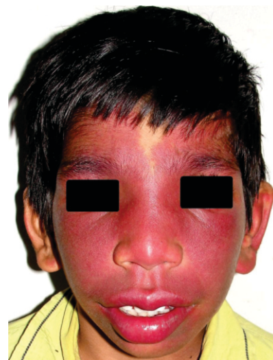
Fig. 2: Bilateral Portwine Stain over the Face and Neck

On clinical examination, patient was in a good general condition, had normal gait, was conscious, co-operative, less oriented with the time, place and as a person with normal vital signs. His face was markedly red and slightly swollen bilaterally, covering whole face including the ears and forehead with central part was spared, on left side extending to neck region suggestive of cutaneous angiomas. Hypertrophy of the upper and lower lips was seen (Fig.2).