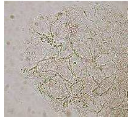
Figure 2. Combination of mycelium strands and numerous spores is commonly referred to as "spaghetti and meatballs"