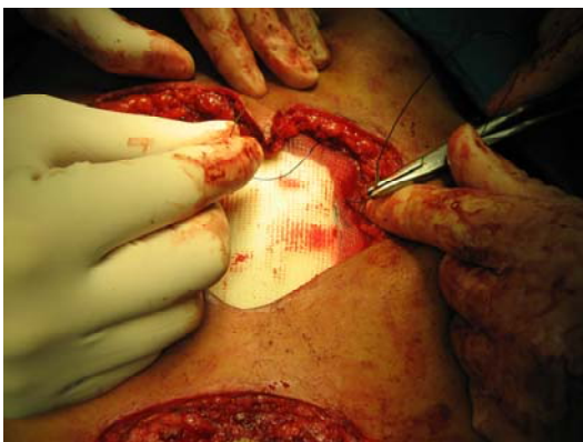
Fig. 2 – Use of Marlex mesh with methylmethacrylate to repair large full-thickness defects after subtotal sternectomy caused by chondroma

The postoperative course was uneventful and the wounds healed by primary intention (Figure 3). At the latest follow-up evaluation (twenty-four months postoperatively), the patient was alive, without signs of local recurrence or distant metastasis and very satisfied with the result (Figure 4).