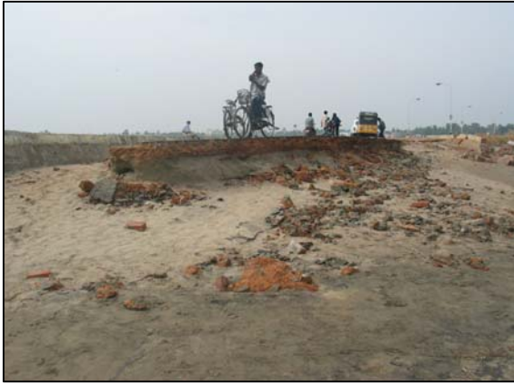
Figure 4: Intense erosion of front portion of beach road, facing to the sea coast at Nagapattinam beach.