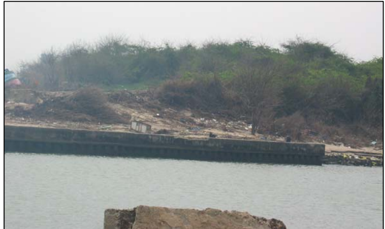
Figure 12: Medu in front of the Nagapattinam port.

Figure 12 depicts the Nagapattinam Medu, existing just in front of the southern part of the Nagapattinam Port. The height of Medu is around 7 m with respect to the port level. Tsunami crossed the Medu. There is Kaduvaiyar River between port and the Nagapattinam Medu (Fig. 13).