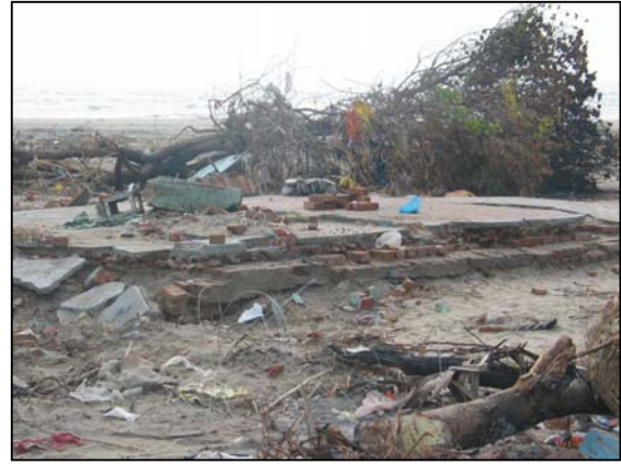
Figure 5: Uprooting of the trees and washing away of destroyed building materials in Vellaipallyam village

The southern part of Tamilnadu from Kanyakumari to Pudukkottai district, situated in the shadow of Sri Lanka, suffered the least damage (Fig. 1 & 2). But, the damage survey revealed large variations in the tsunami run-up and damage. Further, tsunami damage was highly variable from Nagapattinam to Chennai. Maximum tsunami damage (run-up 10-12 m) was observed along the coast of Nagapattinam. There was decrease in damage from Cuddalore to Kanchipuram district. Increase of damage was again observed to the north of Adyar River from Srinivaspuri to Anna Samadhi Park in Chennai district. Along the coast of Nagapattinam district run-up and inundation were 10-12 m and 2-3 km, respectively. General panic was reported every where and people were unable to understand what was happening. Many people were washed away and lost their life.