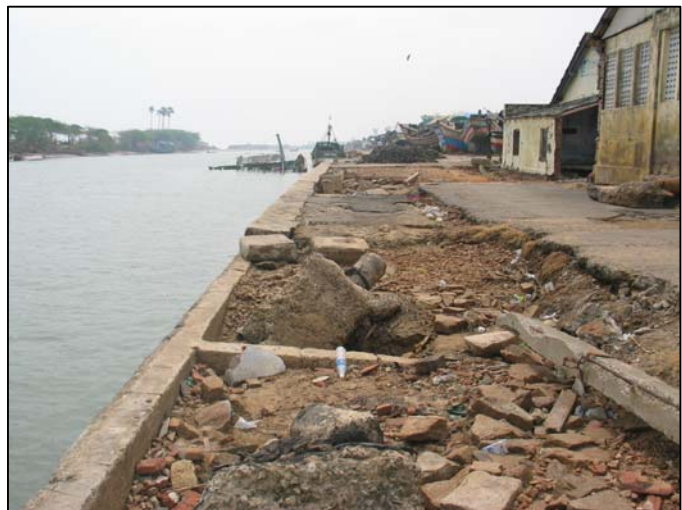
Figure 13: damaged wharf of the Nagapattinam Port.

Similarly, intense damage during the second attack of tsunami, from Keelmanakudy village to Colachal Harbor along the west coast of Kanyakumari, may be due to the lesser width of continental shelf and the interference of receded first waves with the reflected waves from Maldives Islands. It has also been reported in the literature that some times the later arrivals cause more sever damage (Bryant, 2001).