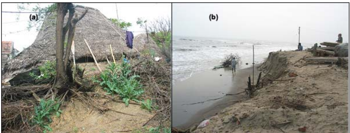
Figure 11: Lightly damaged hut on the front portion of the Nabiyarnagar Medu (left), and intense erosion of coastal land, north of the Medu (right).

Very less damage was observed to the buildings behind the Medu. The huts on the Medu suffered no damage, since tsunami waves were unable to cross the Medu. The height of the Medu was around 14 m. It has steep slope towards north and sea but has gentle slope towards south and behind. Some huts were also washed away which were in front of Medu and at lower elevation. It was reported that coastline has come near to the Medu by 50 m. On the south side of Medu where elevation was lesser houses suffered severe damage. Intense erosion towards north of Medu was observed (Fig. 11b).