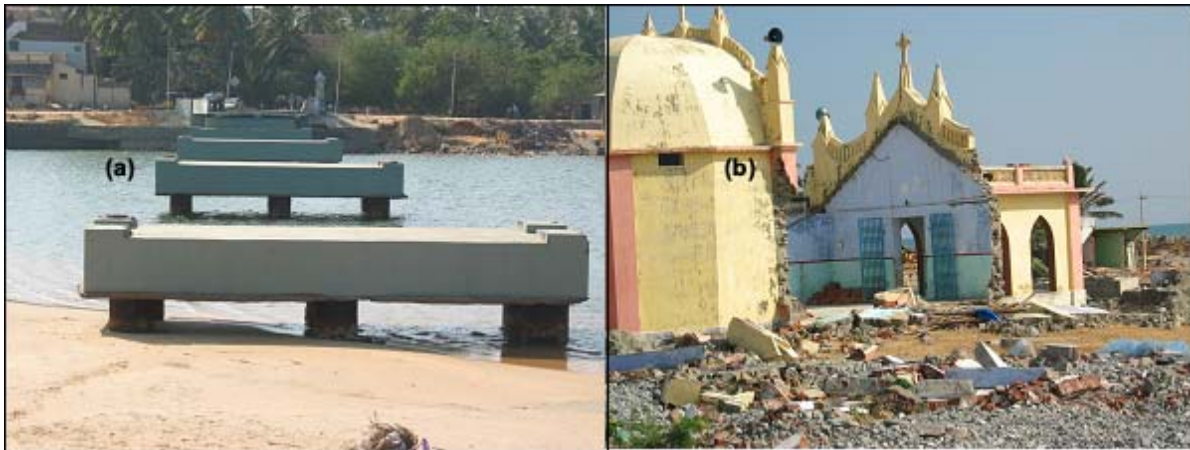
Figure 7: Damaged bridge on the Palyar River, whose spans of the deck were washed away (left), and partially collapsed Church of Keelmanakudy Village (right).

All the four spans of the deck were washed away by the tsunami and two were missing. Almost every building of good quality along the seashore suffered heavy damage (Fig. 7b). Damage to masonry buildings was quite intense; few of them not only collapsed but were completely flattened. There was intense erosion to a road linking the village to the bridge. Variation in tsunami run-up/damage along the west coast of Tamilnadu can be explained considering the interference of first receded waves with the reflected waves from Maldives Islands and the lesser width of continental shelf (Fig. 2). It has also been reported in the literature that some times the later arrivals cause more severe damage (Bryant, 2001).