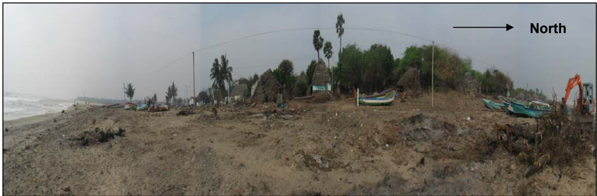
Figure 10: A sketch showing the Nabiyarnagar Medu from the left and front side.