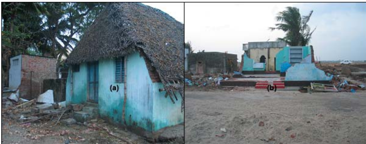
Figure 9: Depicts lightly damaged houses behind the Kilinjal Medu (left), and destroyed structures north of the same (right).

Figure 8 depicts houses and the Kilinjal Medu from different locations. We observed that there was no damage to even huts built on the Medu (Fig. 8a). The presence of Medu prevented damage of many huts/houses behind it and finally the loss of human life also. Figure 9a shows a hut, which suffered almost no damage since it was behind the Medu. Severe damage to collapse of houses occurred to the north and south of Medu. Figure 9b depicts damaged houses, which were situated to the north side of the Medu. It was general feeling of the residents of this village that Medu has saved much loss of human life and houses.