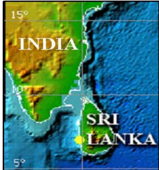
Figure: 2 Coastal and ocean basement topography around Tamilnadu and Sri Lanka.

The general observations as reported by many people in the affected coastal areas of Tamilnadu are mainly tsunami crest as the first arrival i.e., the first arrival was a positive wave and the largest tsunami amplitude was observed as the first arrival on the eastern coast and the second arrival on the western coast. IOC (1998) (Intergovernmental Oceanographic Commission) post tsunami survey field guide was used to measure run-up, inundation and other useful information regarding tsunami. The hatched area shown in figure 1 depicts the surveyed locations. The names of localities, their serial number, locations, tsunami run-up and inundation, number of casualties and first arrival time of tsunami are given in table 2.