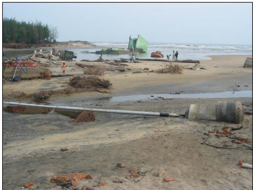
Figure 3: Depicts the damaged children's park, uprooted electric pole, damaged SINGNADH and the collapsed auditorium on Nagapattinam Beach.

It can be inferred that the amplitude of tsunami should decrease from south to north along the coast of Tamilnadu, on the basis of location of epicenter of Sumatra earthquake and the orientation of rupture plane. But, the damage survey revealed large variations in the tsunami run-up and damage pattern.