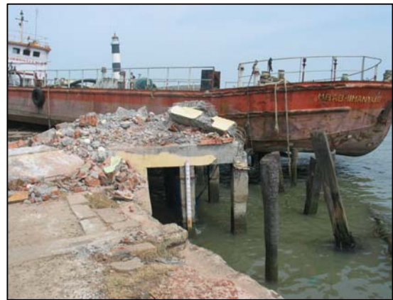
Figure 6: Damaged structure on the Nagapattinam Port due to the collision of a boat thrown by tsunami.

Further, heavy damage was observed from Keelmanakudy village to Colachal Harbor on the west coast of Kanyakumari. Largest tsunami run-up (9-10 m) was reported during the second inundation of the tsunami. The decreasing trend of damage was observed from Keelmanakudy village to Colachal harbor. Around 70 people lost their life in Keelmanakudy Village. A newly constructed bridge on Palyar River suffered severe damage (Fig. 7a).