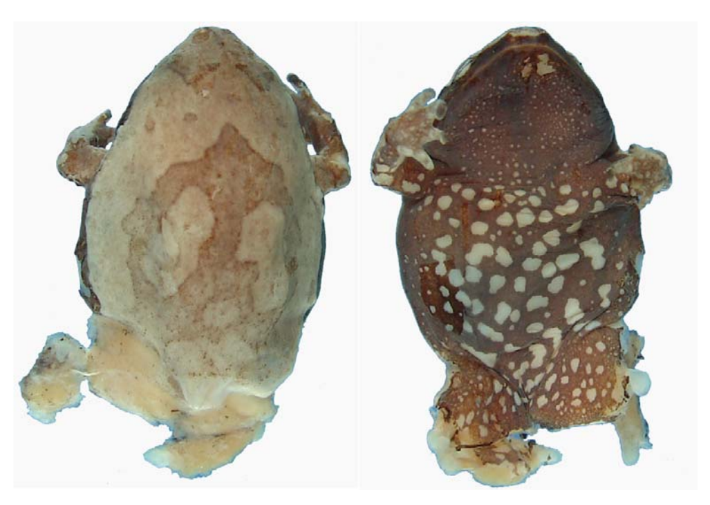
Figure 1. Dorsal and ventral view of the juvenile of Hyophryne histrio , found in the stomach of C. aurita (MNRJ 19030) from Nova Viçosa, BA. Snout-vent length app. 20 mm.