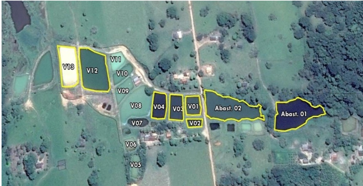
Figure 1 - Vale do Rio Machado fish farm

This study was conducted between August 2015 and June 2016, with monthly collections performed in the mornings. A total of eight collection points (supply reservoirs 01 and 02; and ponds 01, 02, 03, 04, 12 and 13) were assessed (Figure 1).