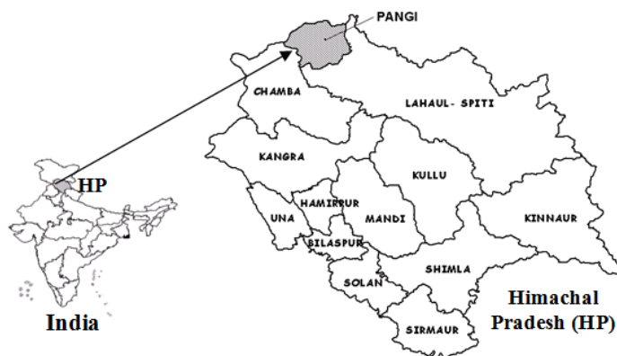
Fig. 1. Map of study area

The study area (Fig. 1) lies between 32° 12' 41" to 32° 47' 59" N latitude and 76° 13' 56" to 76° 47' 48" E longitude. The elevation ranges from 2006 to 6168m amsl (average elevation 4008 m). The geographical area of Pangi valley is 1,52,371.04ha and Killar is its administrative head quarters. It lies in the semi-arid zone of inner Himalaya and thus witnesses severe winters and heavy snowfall. It is located in upper part of Chamba district of Himachal Pradesh between Pir Panjal and Zaskar ranges of western Himalaya. It is bounded by Jammu & Kashmir in the north, Lahaul & Spiti in southeast, and Chamba in southwest. The region is drained by Chenab river, which is also known as Chandrabhaga.