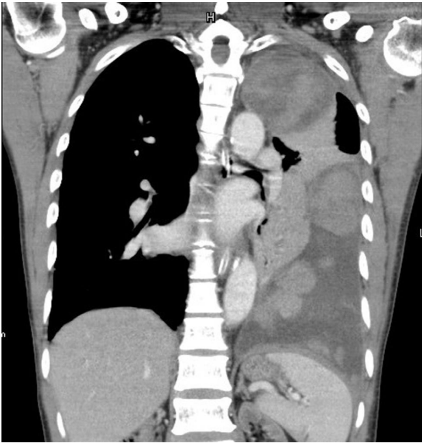
Figure 2. Contrast-enhanced CT revealed multiple well-defined heterogeneous mass lesions and homogeneous fluid accumulation of blood within the pleural space.

ning 68% PMN and 24% lymphocytes, protein: 6.32 g/dl, LDH: 1251 U/L, glucose: 13.36 mg/dl, and pH: 7.153. Serologic tests for tumor marker were all negative. Contrast-enhanced computed tomography (CT) revealed multiple well-defined mass lesions in the left lung Figure 2 . He received video-assisted thoracic surgery (VATS) and insertion of an intercostal tube was performed. VATS showed multiple huge bloody clots without visible bleeding source or malignant lesion. All cultures and pathology were unremarkable. The diagnosis of spontaneous hemothorax complicated blood clots formation was made. Following an uneventful post-admission period, he was discharged smoothly. Currently, he presents a good clinical status and has no evidence of relapses.