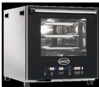
Fig. 1. Combi-steamer UNOX SPA of XVC series (Italy)

As objects of research there was used carotene-containing raw material – carrot ( Fig. 2 ) and pumpkin ( Fig. 3 ) and fine-dispersed puree of carrot and pumpkin in nanosized form ( Fig. 4 ).