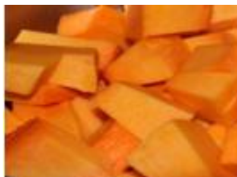
Fig. 3. Initial raw material (pumpkin)