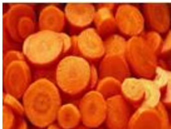
Fig. 2. Initial raw material (carrot)