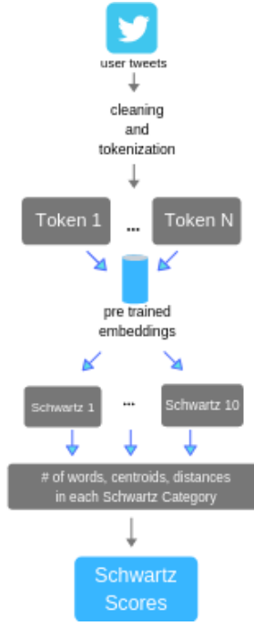
Figure 2: BHV scores prediction pipeline. User tweets are cleaned and tokenized, each token has its own 300 dimensions array representations from GloVe embeddings. Each token array-shaped is assigned to the closest Basic Human Values reference centroid. Then, we sum up the number of words in each cluster and we multiply it by the inverse of the average position of these words. We obtain ten community based scores per user with this process.

We give tokenized and vectorized words as input to the FFM and BHV models described in Section 3, where we explain how to calculate them. This process creates as output five scores regarding FFM (Five Factor Model) and ten scores for BHV (Basic Human Values). The FFM and BHV scores are the inputs, while the micro-influencer labels previously computed are the expected outputs of three supervised classifiers, SVM, Random Forest, and CNN, and an ensemble model, XGBoost.