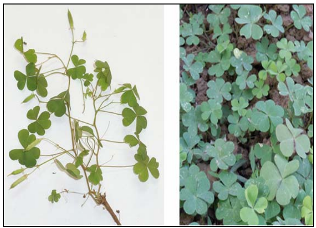
Fig.1: Image of Oxalis corniculata Linn.

Oxalis corniculata Linn. is a sub-tropical plant being native of India, are commonly known as creeping wood sorrel [6]. It is a somewhat delicate-appearing, low-growing, herbaceous plant abundantly distributed in damp shady places, roadsides, plantations, lawns, nearly all regions throughout the warmer parts of India, especially in the Himalayas up to 8,000 ftcosmopolitan [7,8].