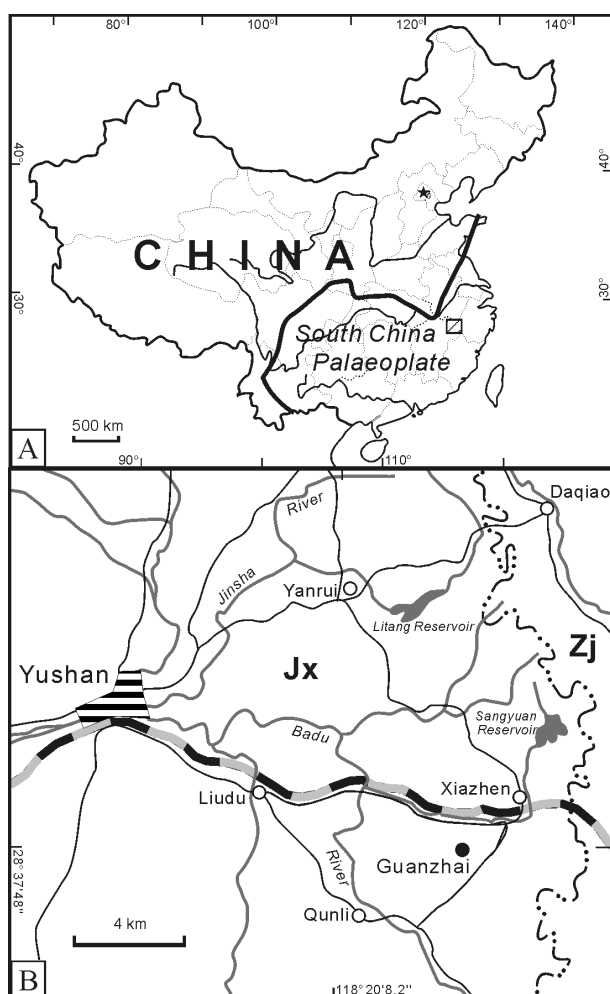
Fig. 1. Location map of the study area. (A) Map of China, with Beijing marked by a star and the study area in East China by a streaked square. (B) Enlarged map of the study area (Guanzhai of Xiazhen), Yushan County, northeastern Jiangxi Province, marked by a solid circle. Jx, Jiangxi Province; Zj, Zhejiang Province.

report the occurrence of encrusting cornulitids on the Ordovician brachiopods from the South China Palaeoplate, and to discuss the palaeoecological implications of their commensal relationship.