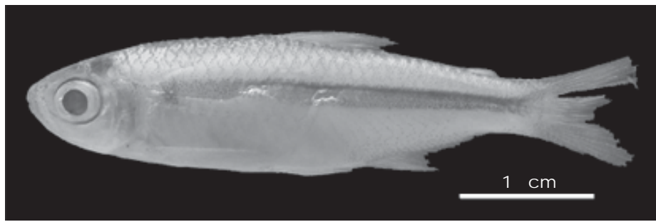
Fig. 2. Bryconamericus singularis n. sp.: holotype, MCNG 33.41 mm SL.