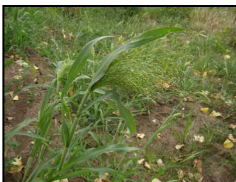
Fig. 2. Panicum miliaceum L. subsp. agricolum Scholz et Mikoláš at Borzești (Bacău County), on fallow grounds