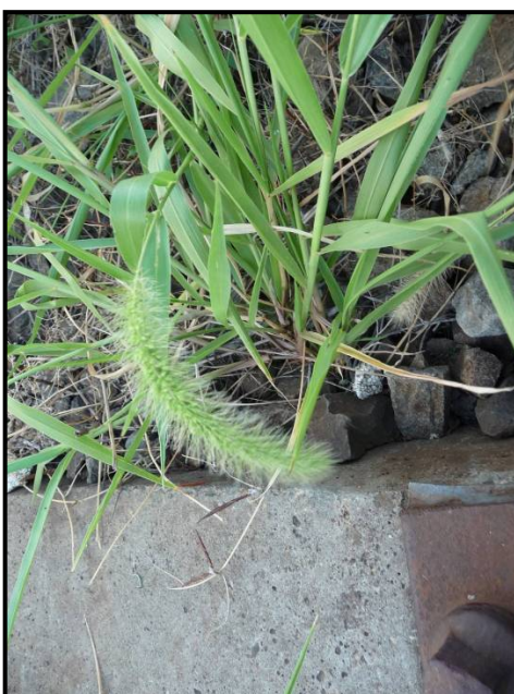
Fig. 6. Setaria faberi R. A. W. Herrm. in railway station of Bacău town