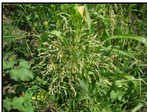
Fig. 4. Panicum miliaceum L. subsp. runderale (Kitag.) Tzvelev at Tăcuta village (Vaslui County), in maize crops