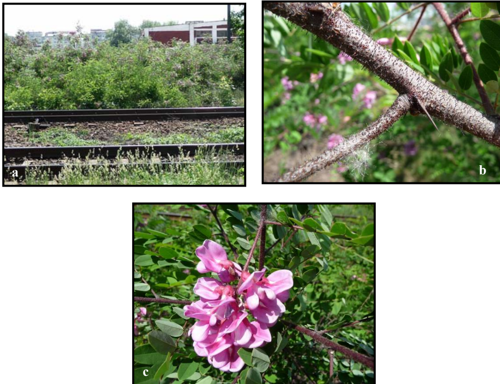
Fig. 3. Robinia neomexicana Gray var. neomexicana in Iași city a. general habitus; b. shoots; c. racemes