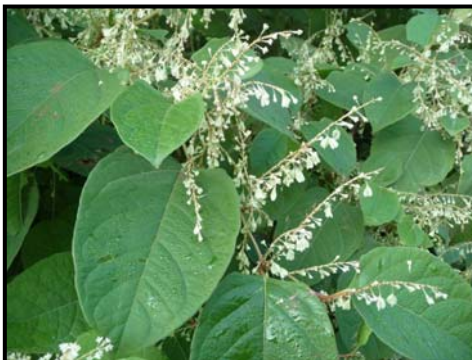
Fig. 7. Reynoutria × bohemica Chrtek et Chrtková at Stolniceni village (Vâlcea County)