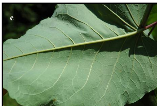
Fig. 8. Reynoutria sachalinensis (F. Schmidt) Nakai between Rusca Montană and Rușchița villages (Caraș Severin County) a. general habitus; b-c. leaves