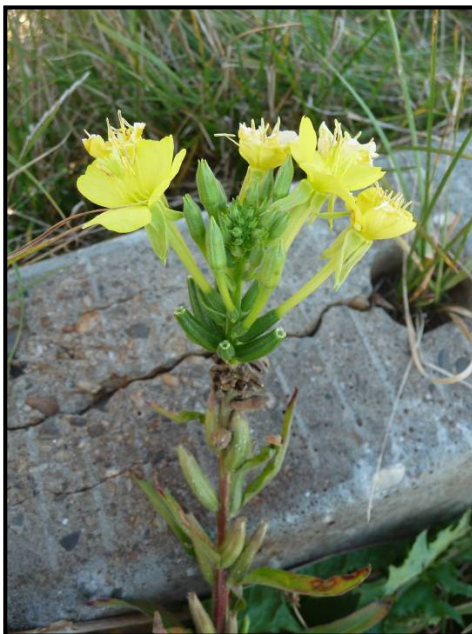
Fig. 5. Oenothera parviflora L. at Stolniceni village (Vâlcea County)