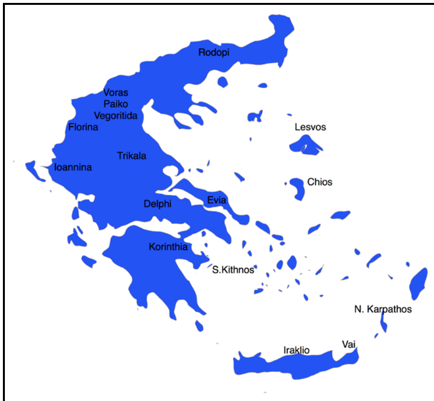
Figure 2. Map of Greece with study areas

On two different studies in the Prefecture of Florina, Greece (Figure 2), the development of agrotourism in the area was investigated, as well as the contribution of agrotourism to the economic development of the local community (Papageorgiou, Alebaki, 2008) and the economic development of the local community as well as the wider area (Stamatopoulou, 2008). Analysis of the data collected through surveys revealed that agrotourism accommodations appeared in the region during the 1990s. A characteristic example of this delay is the fact that the first agrotourism accommodation was established in 1996, despite the fact that the Regulation for Subsidizing Agrotourist Acts had been established since the 1980s. Until 1996, only some passing tourists visited the area with the main attractions being the unique ecology of the area and observation of migratory birds, there is, thus, only a decade of economic development in the region that has been affected by agrotourism. The prefecture of Florina is a classic case of a mountainous, less favored area, where the