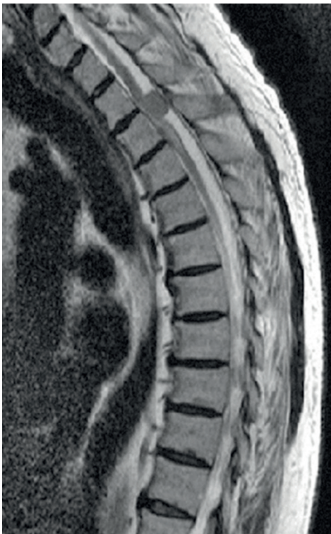
Figure 1. Magnetic resonance imaging findings of thoracic spine extramedullary intradural mass; suspicious meningioma at T2-3 level.

Hypoesthesia and deficit in deep sensory perception at the T4 level were present on physical examination. The reflex of patella tendon and the reflex of Achilles tendon were hypotonic. Lower-extremity motor weakness: right iliopsoas, quadriceps and hamstrings were grade 0, left iliopsoas, quadriceps, hamstrings were grade 1 and right and left tibialis anterior were grade 0 and 4, respectively. In addition, a significant spasticity (Ashworth 3) was present in both lower extremities and Babinski reflexes were bilaterally positive.