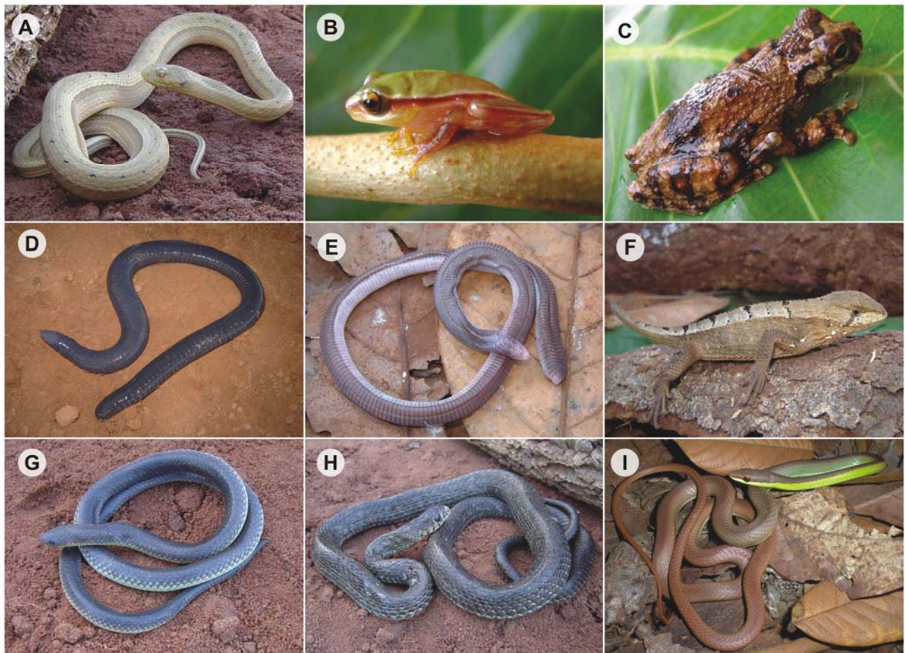
Figure 2. Representatives of some of the amphibians and reptiles recorded at the UHE Espora. A, Thamnodynastes hypoconia ; B, Dendropsophus jimi ; C, Dendropsophus soaresi ; D, Siphonops paulensis ; E, Cercolophia roberti ; F, Stenocercus sinesaccus ; G, Atractus albuquerquei ; H, Philodryas patagoniensis ; I, Philodryas mottogrossensis .