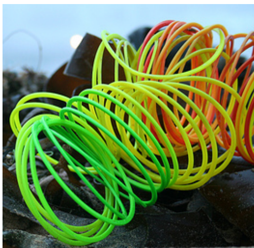
Figure 2. Symbolic representation of the impacts of colonialism on interconnections in Cree worldview.

Earlier, a spiral was presented (Figure 1) that illustrated an interconnected worldview that was supported by the Cree teachings of wahkohtowin and Natural Law. When the Cree people were prevented from teaching these values, rules, and way of life, the scaffolding that ensured healthy, respectful relationships was severely damaged, and the spiral collapsed upon itself. The critical relational boundaries were transgressed. The spiral, for some families and communities has become a tangled, chaotic knot as illustrated in Figure 2.