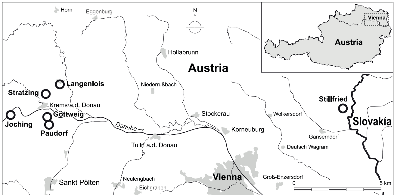
Fig. 1. Study sites in Lower Austria.