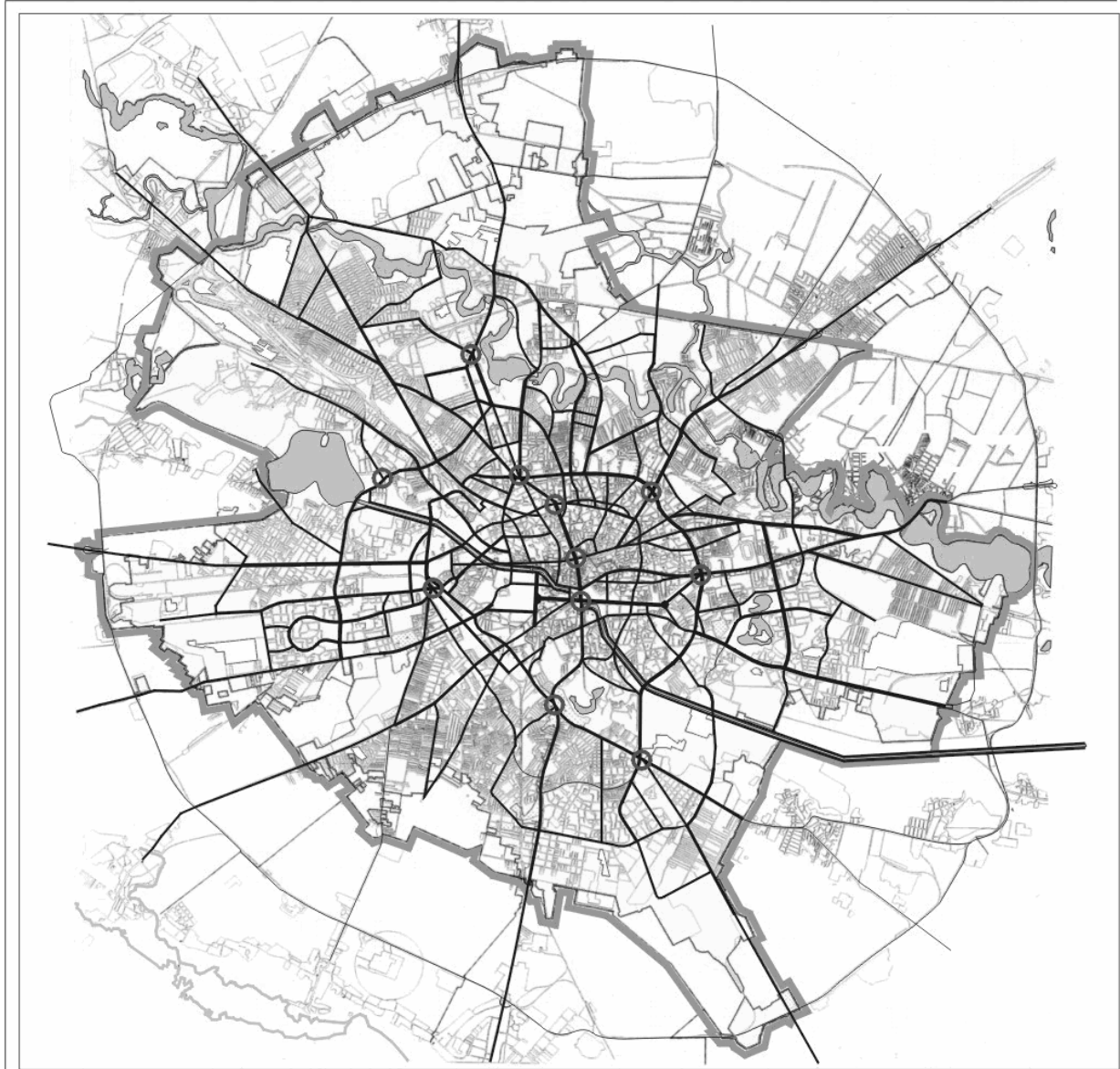
Fig. 1. The main roads network and urban structure of Bucharest area Рис. 1. Основная дорожная сеть и городская структура зоны Бухареста

Many Romanian cities had small general stores near residential areas (most of them as multilevel small flats), but the goods inventory was very poor.