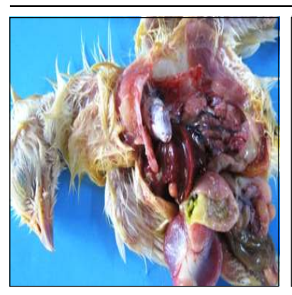
Figure-1. Pale, enlarged kidney and Figure-2. Embryo showing dwarfism urate deposition in the heart of 10 dayold broiler chick.