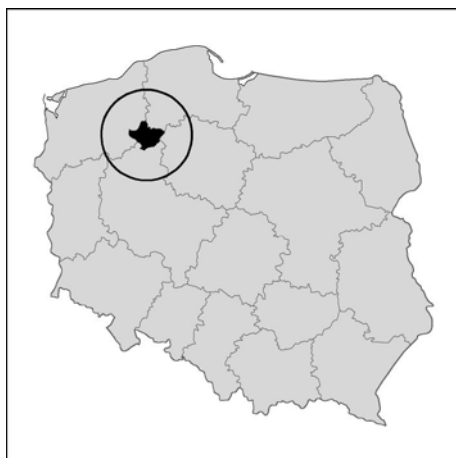
Figure 2: Powiat Złotów, Poland

The Złotów district is located in the north-west of Poland, in the northern part of Wielkopolska Voivodship. The district has an area of 1.661 km 2 and is one of the largest districts in terms of area in Wielkopolska Voivodship (Borsig et al. 2007: 67-68). Złotów district is very rural in nature. This is shown both in the below-average population density compared to national level (2005: 122 inhabitants/km 2 ) of 41 inhabitants per km 2 and in the settlement structure. Of the eight self-governing communities of the district only two communities (Złotów: ca.18.500; Jastrowie: ca.11.500) have over 10.000 inhabitants and only the city of Złotów has an urban character.