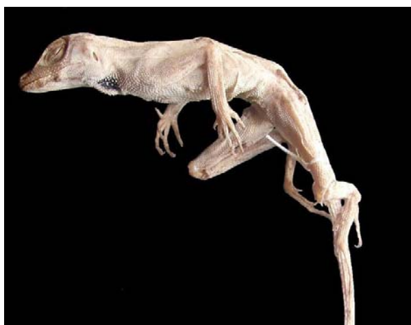
Figure 1. Lateral view of Anolis nitens tandai (LPHA 1879) from Parauá, municipality of Santarém, State of Pará, Brazil.

Anolis nitens tandai Ávila-Pires, 1995 is a diurnal lizard, frequently found on leaf litter of the humid tropical rainforests from Central and Occidental Amazon, in the states of Acre and Amazonas, Brazil (Ávila-Pires 1995; Vitt et al. 2001). On 12 October 2001 at 09:20 h, we collected one specimen of A. nitens tandai (Figure 1) in Parauá (02°50'38" S, 55°10'54" W), municipality of Santarém, State of Pará, Brazil. The individual was observed on the ground in a gallery forest, and it was captured in a shrub 25 cm high.