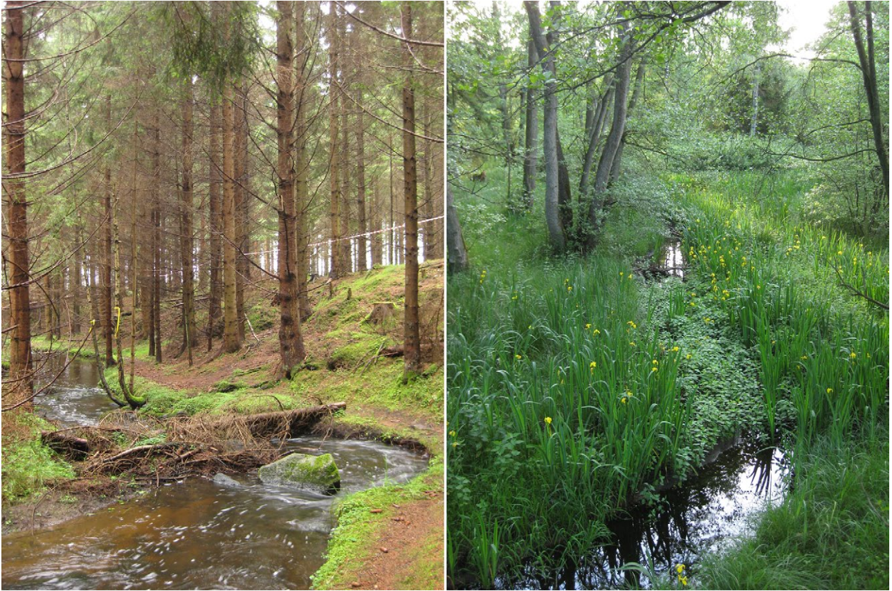
Figure 1. The headwater stream Øle Å runs through privately owned plantations. Most of the area subject to restoration was previously used intensively for timber production with Norway spruce (left, degraded). Other largely untouched stretches function as a guiding image (right, reference).

Photos from September and June 2014 respectively by Jonas Morsing.