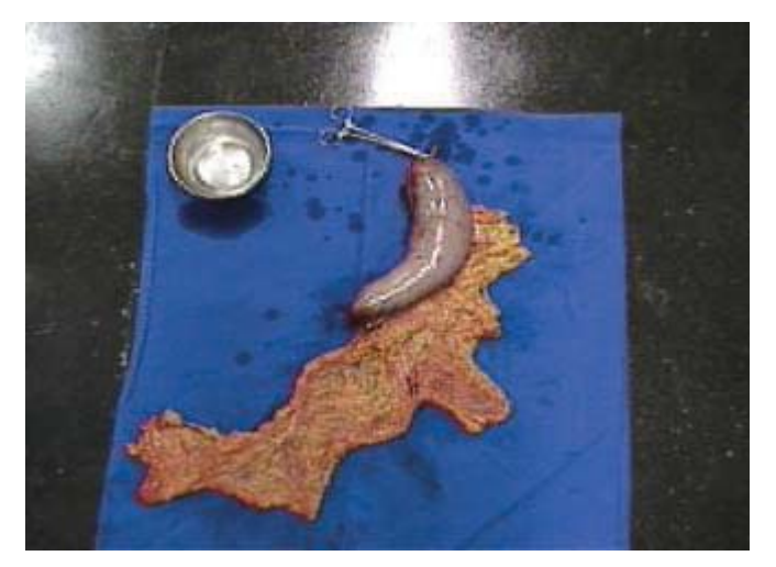
Figure 2. Specimen of gastroepiploic resection